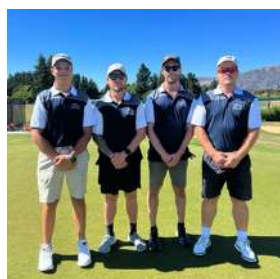
Senior B Pennants Team